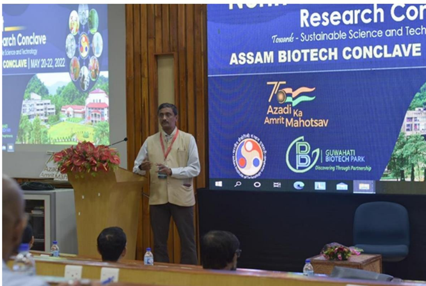
Assam Bio Innovation Research Fellowship