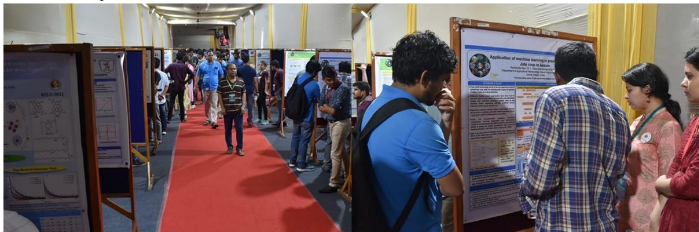
Poster Presentation at Exhibition hall