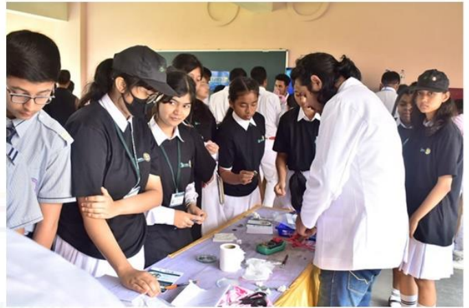
Royal Society of Chemistry hands-on training to school children on Global Battery experiment, Inspirational science for NE Region school students during North East Research Conclave 2022 at IIT Guwahati.