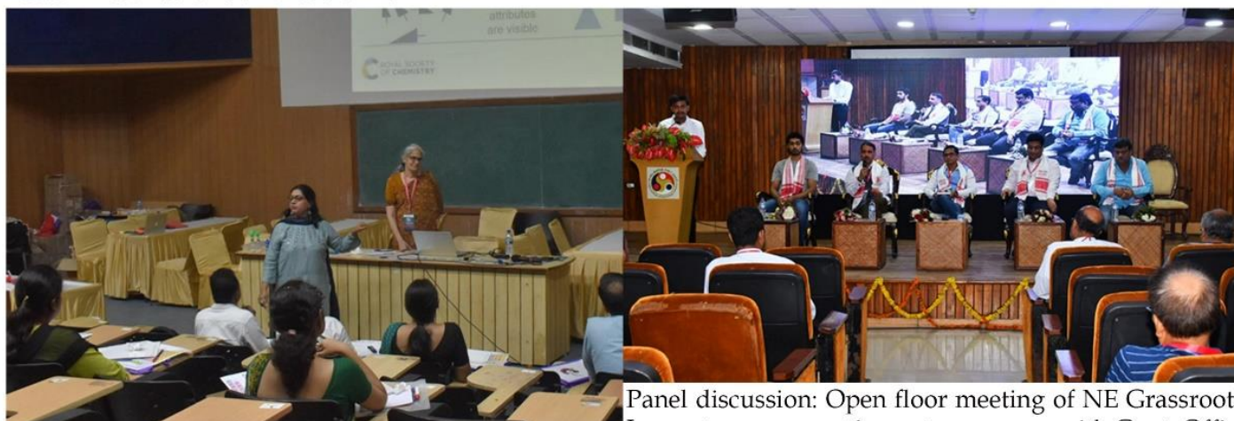
Creating skilful educators: A teacher training program