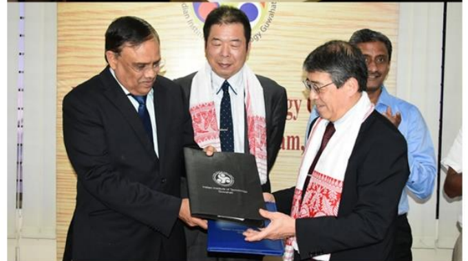
IIT Guwahati signed MoU with NTT Advanced Technology Corporation, Japan to collaborate on various technology, student internship and other joint programs.