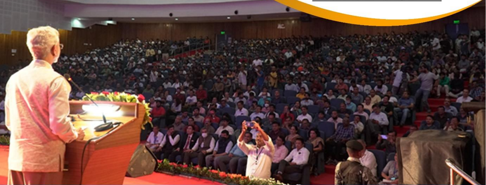
The Minister of External Affairs Dr. S. Jaishankar Glimpses Interaction with the Faculty, Staff and Students