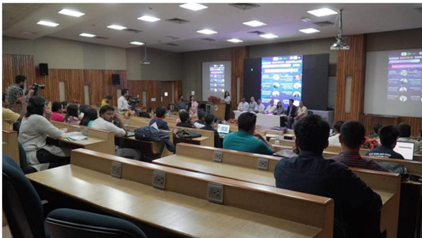
Investors Pitch: Raise money for your Start-up