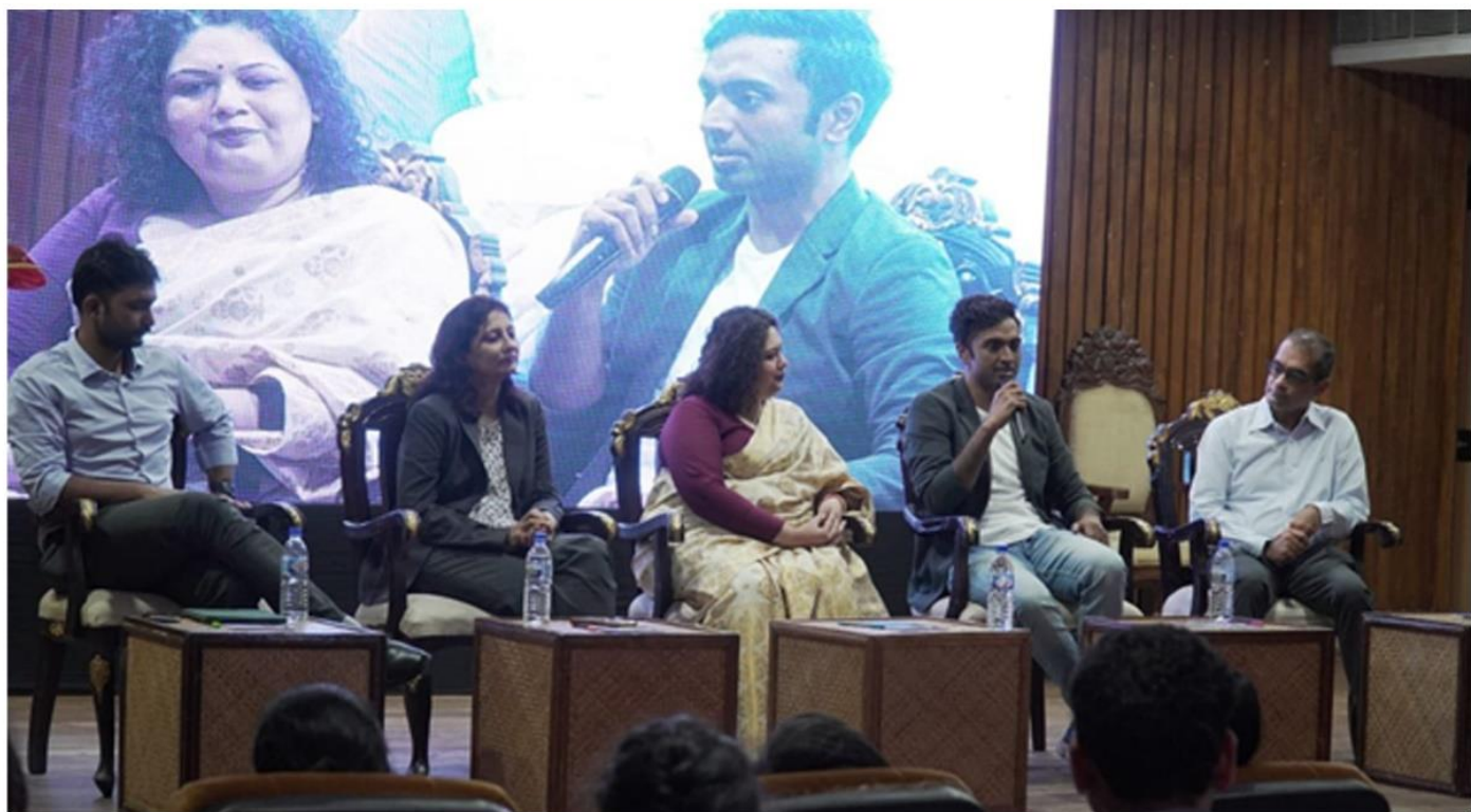
India at the cusp of Med-tech Revolution