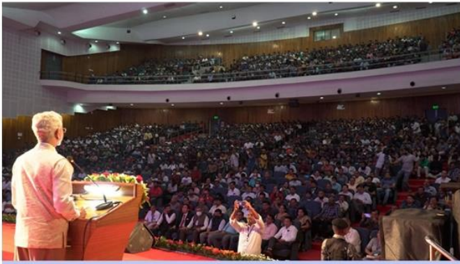
Glimpses Interaction with the Faculty, Staff and Students