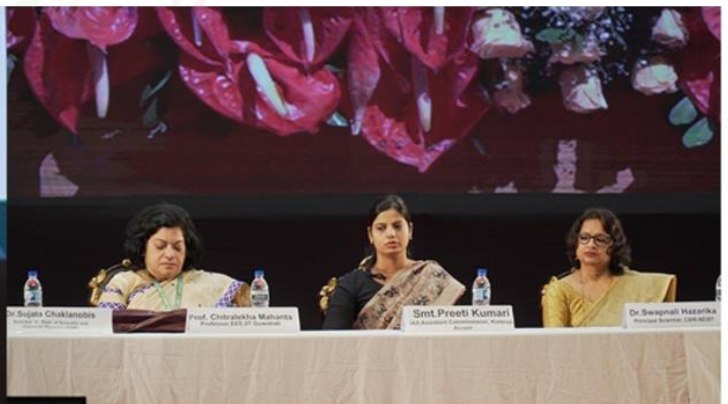
Women in R&D: A program to bring in and recognize the efforts of women in Research & Development.