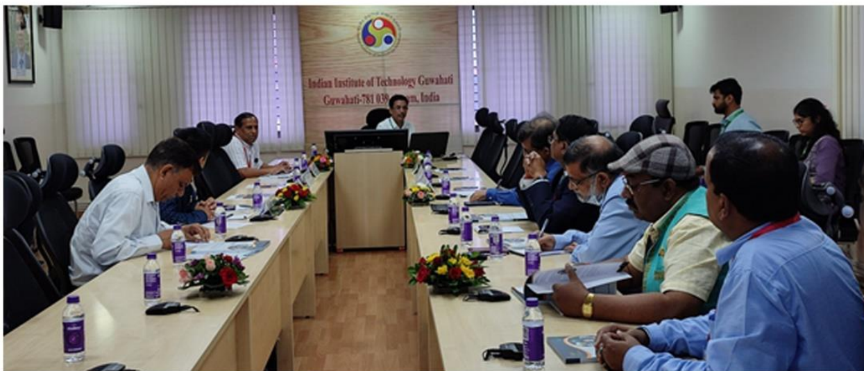
Panel Discussion: Brain Storming Session on Handholding Mechanism for Sustained Research and Innovations Among North-East Institutions.