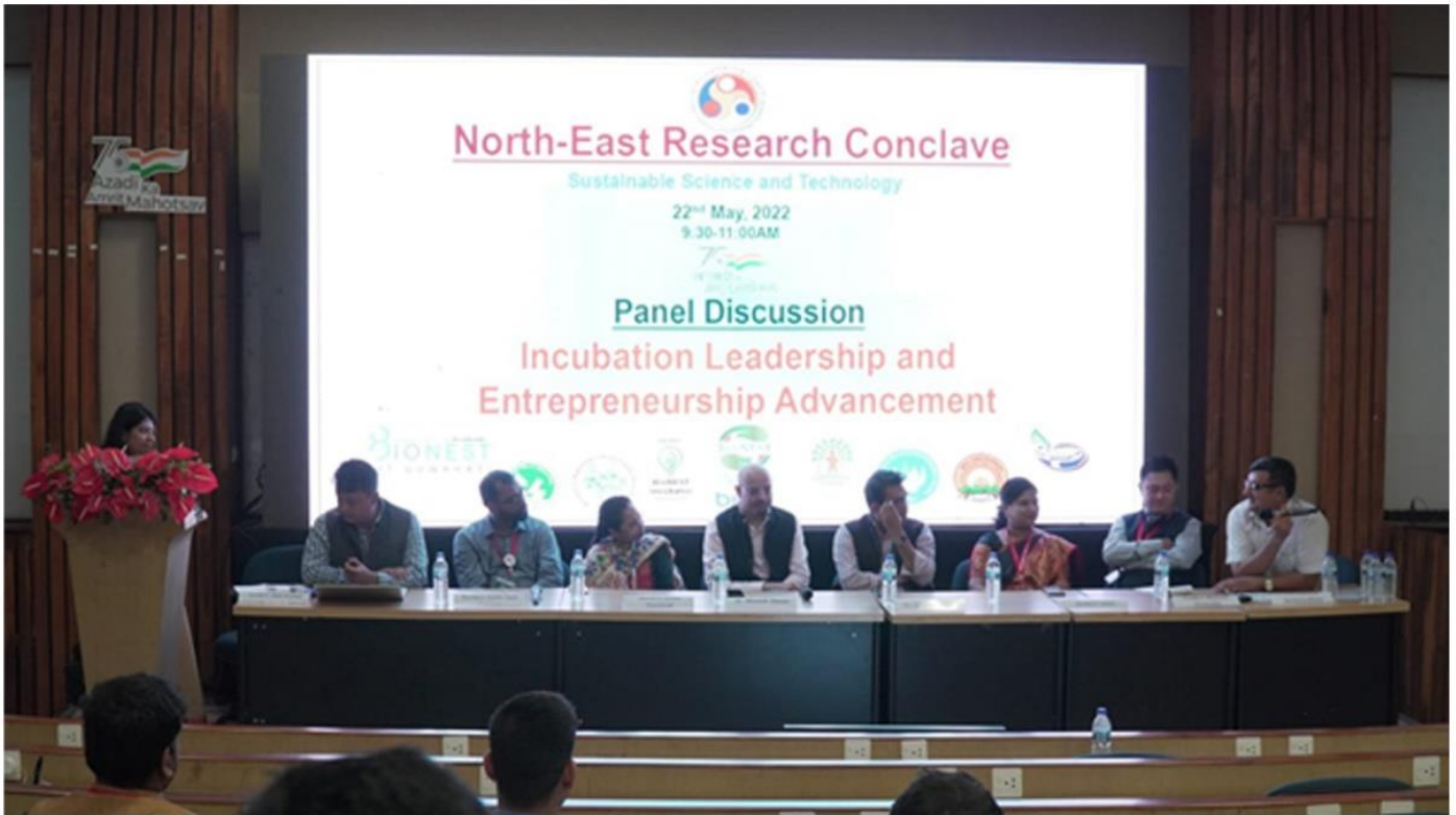
Panel discussion: Incubation and Entrepreneurship Advancement